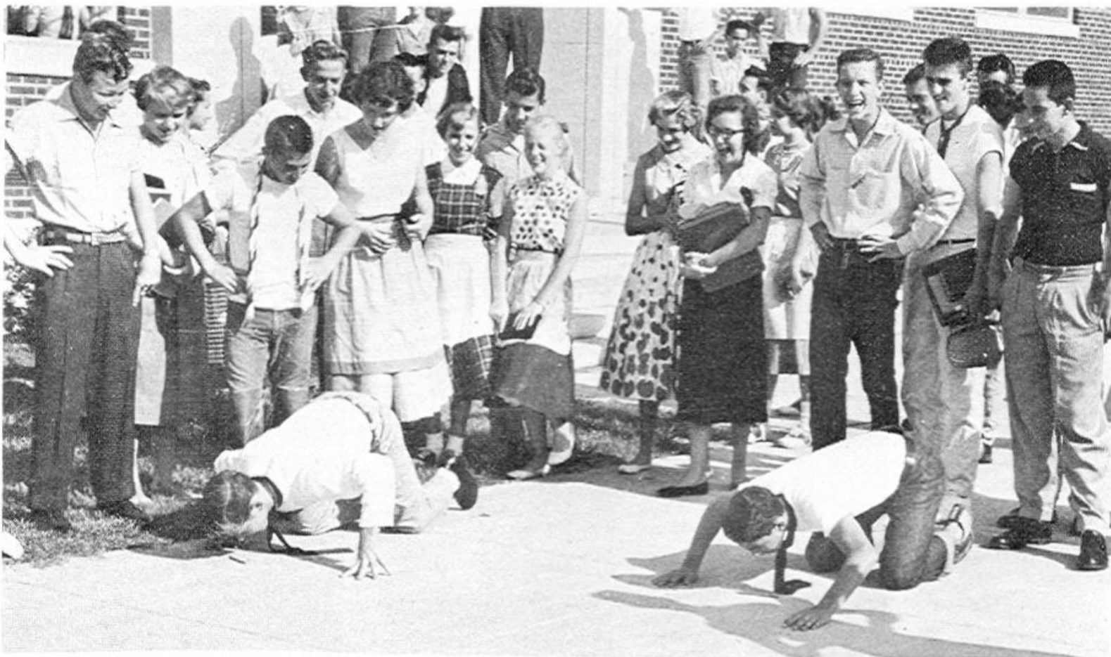
Our class in September, 1955, during Freshman Initiation Week.

We want to express this pride and the love we all feel for our Alma Mater in a tribute to and collection of "Cradock Memories", The 1959 Admiral.