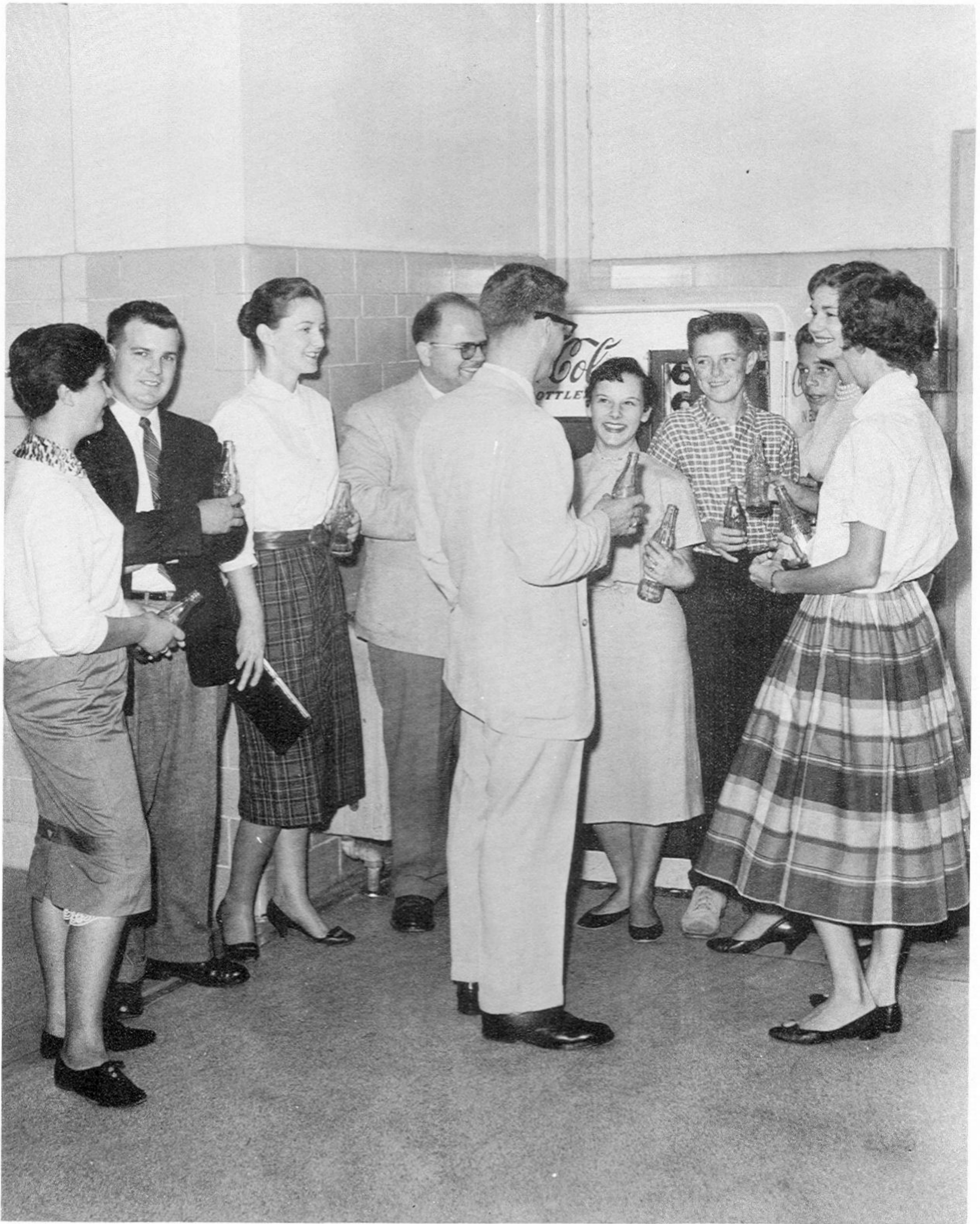
Some of the new faculty members and Cradock students get together for a coke break.