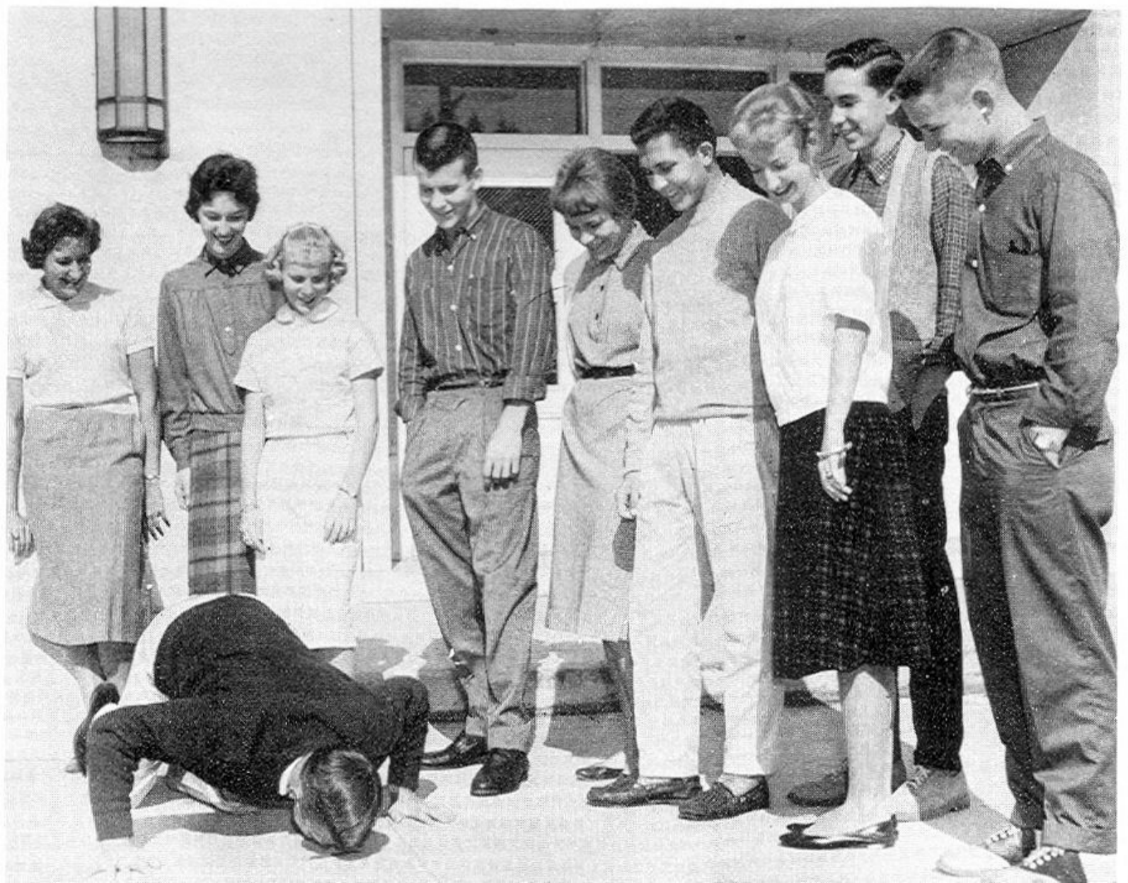
September, 1958, at the beginning of our Senior year.